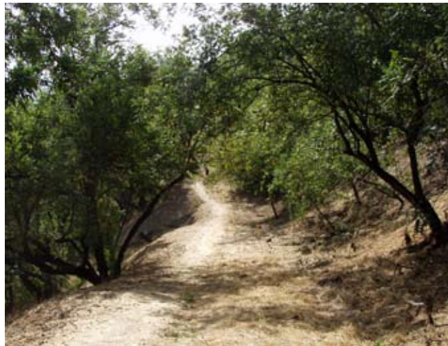
“DIRT” BURNELL

The 7 lots along “dirt” Burnell, including some with addresses on the paper street Davenport, are contiguous with Elyria Canyon Park. The lots are on both the upslope and the downslope, and they contain a natural vernal stream runoff to the paved street, Bridgeport, below. The area is classified as California black walnut woodland with associated native trees including Oak, Toyon, Elderberry,