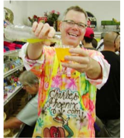
ABOVE: CHARLES PHOENIX SERVES CANDY AND SODA "POPTAILS" BELOW: GREGER WALNUM'S BLUES BAND WILL PROVIDE MUSIC FOR MWA'S ANNIVERSARY PICNIC

Inside the store, Retro Folk Humorist Charles Phoenix, dressed in a wild florescent jumpsuit and rhinestone bowtie, mixed up three different concoctions of soda, candy and whipped cream for the huge line of soda tasters winding their way through the store at the tasting stations. Many walked out of the store with armloads and baskets of their favorite gourmet root beers, cream sodas, and choco-pops. Ticket sales and the profits of the stores sales all went to the Friends of the Southwest Museum to cover expenses of various grant activities and to support the litigation efforts of the Highland Park Heritage Trust and the Mount Washington Ho-