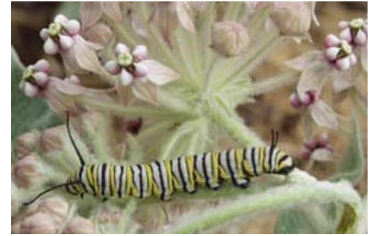
MONARCH BUTTERFLY CATERPILLAR

Each summer, along the trail that leads from the sharp curve on Killarney Avenue down into Elyria Canyon Park to the red barn, a small stand of native, perennial Indian Milkweed, Asclepias eriocarpa , sprouts just above the ranger station. This summer, members of the Beautification Committee went rogue and erected an informational, hand-painted sign for this sensitive ecosystem with the goal of educating hikers and dog walkers who use the trail. About a month after erecting the sign, the milkweed began to bloom, and this year, several monarch butterfly caterpillars were spotted among the woolly gray