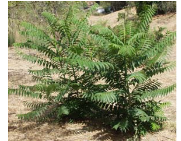
LEFT: DEAD AILANTHUS BELOW: AILANTHUS SPROUTS

Work Party meeting day. We now meet on the fourth Sunday of the month from 9:30 to 11:30 at the Red Barn. We need volunteers to work in the nursery planting local seeds and caring for young plants, keeping the meadow near the Red Barn clear of invasive weeds, and working in other parts of the park to remove invasive exotic plants that compete with native species. Read about some of those efforts in the Milkweed Meadow piece in this issue. Come out and show your support on September 25 and October 23.