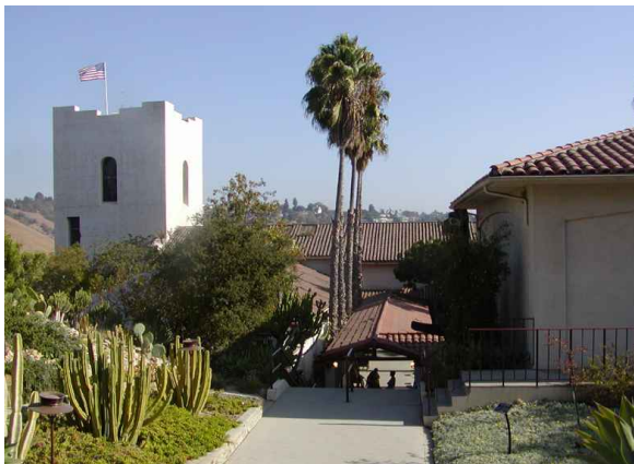
The Southwest Museum – a treasure trove of artifacts and history on our hill!

OK. We know. You're busy. But our voice is strongest at City Hall when we speak for many. Make a modest dues donation each year. Read the newsletter. The simple act of adding your voice to many others empowers us together!