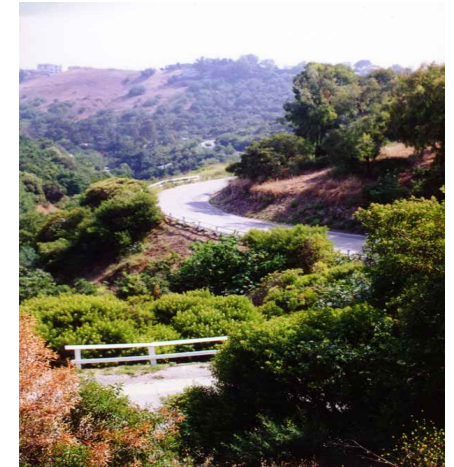
Mount Washington Drive curves uphill

The Alliance is excited about its accomplishments. We received a grant from the City of Los Angeles to develop quiet reading garden spots for students at Mount Washington Elementary School. The California Council for the Humanities awarded a grant to develop a comprehensive oral history of Mount Washington. Our Beautification Committee is often found cultivating our bountiful open park space – land preserved forever by work of our activists. We are proud of creative projects that bring people together to collaborate positively!