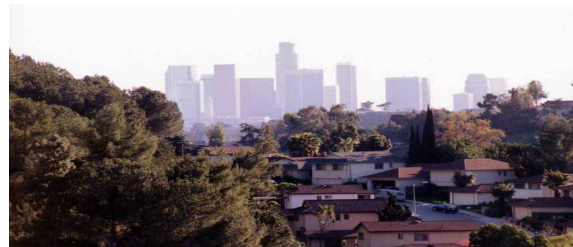
Downtown skyscrapers peek over the hill

The Alliance works for YOU. We welcome your concerns and we listen by conducting surveys or public forums. We are not afraid of a diversity of opinion as we all work toward a shared vision for keeping Mount Washington a great place to live. We urge members to propose ideas, join a committee, and to attend membership meetings. Be empowered—become as active as you can in the Alliance!